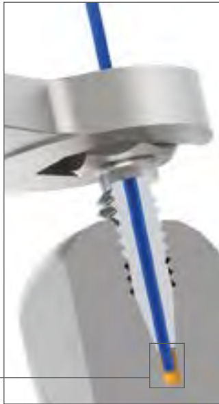
EXTRA INTERNAL VOLUME

Conventional coned fittings require a ferrule in conjunction with a fitting for proper sealing. They depend on complex techniques, including tools, to improve sealing performance, which significantly increases probability of extra internal volume and poor chromatography results. The excessive force needed for tightening increases wear of expensive components and the likelihood of replacement, adding to overall costs.