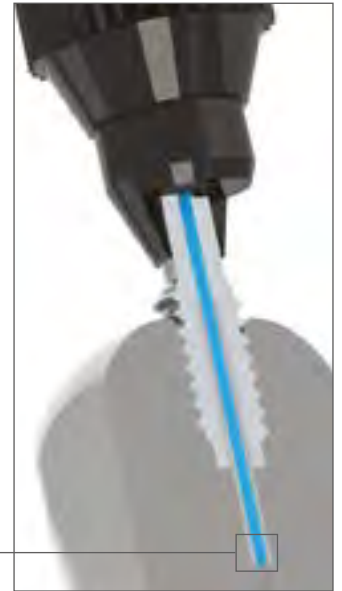
ZERO DEAD VOLUME

MarvelXACT fittings do not depend on ferrules. They seal at the bottom of the port, without complex techniques, which significantly reduces required torque and enables many more connects and disconnects. MarvelXACT significantly reduces wear on your hardware, increasing product life. An enhanced proprietary tip design also ensures zero dead volume (ZDV) and better chromatography results.